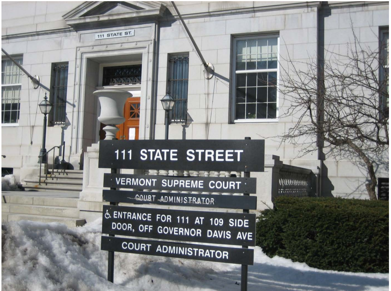
State Supreme Court closed on some Fridays and some Tuesdays-See below