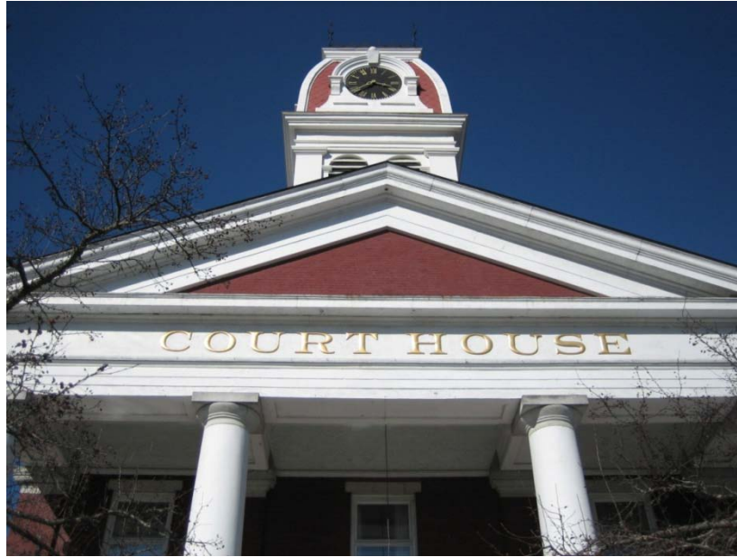
County Courthouse in Montpelier, Vt.